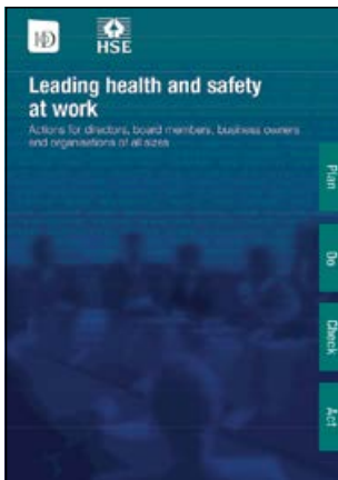
This is a web-friendly version of leaflet INDG417(rev1), published 06/13

Actions for directors, board members, business owners and organisations of all sizes